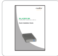
Quick Installation Guide