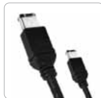
FireWire 400 Cable