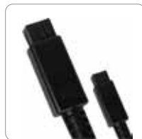
FireWire 800 Cable